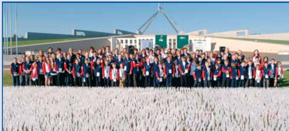
■ Young ambassadors raise diabetes awareness in Canberra.

Last year the Federal Government committed $30 million to the