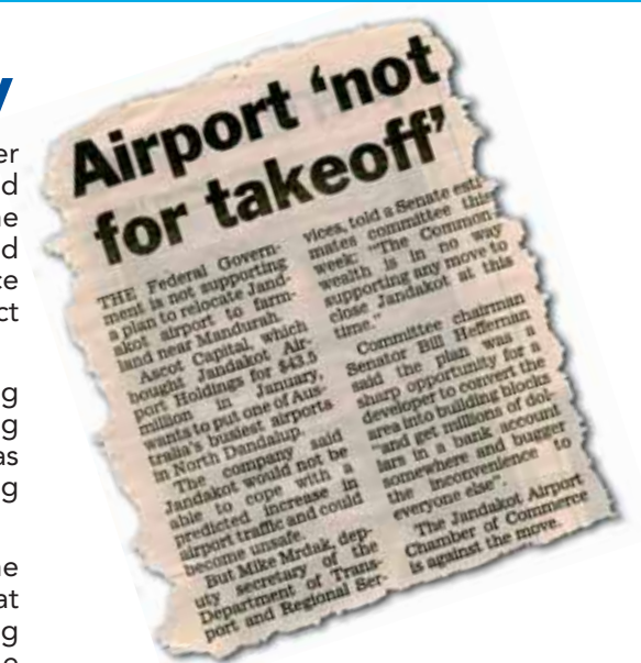
■ Sunday Times, November 11 2006, p16

"The Federal Government is not now, and will not in the near future, support